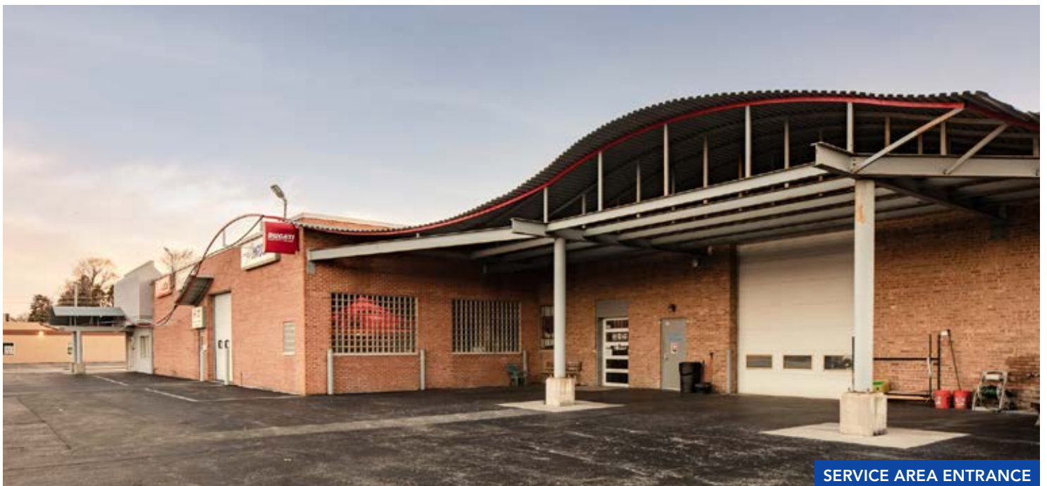
SERVICE AREA ENTRANCE