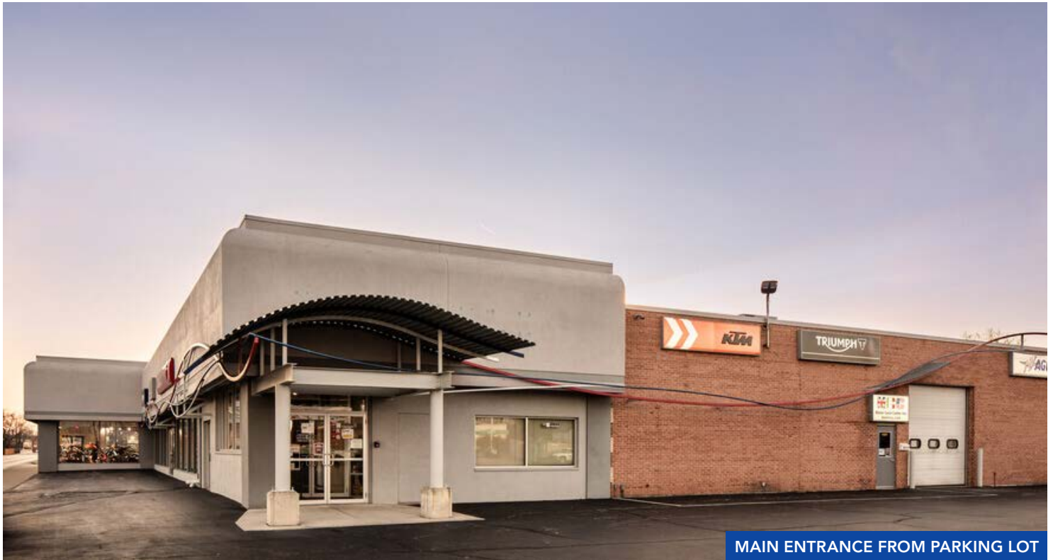
MAIN ENTRANCE FROM PARKING LOT