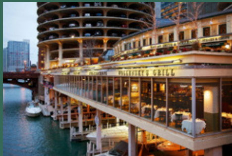
SMITH & WOLLENSKY 318 N. State Street 2 min walk from 400 N. State Street