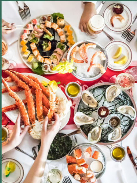
SHAW'S CRAB HOUSE ▲ 21 E. Hubbard Street 3 minute walk from 400 N. State Street