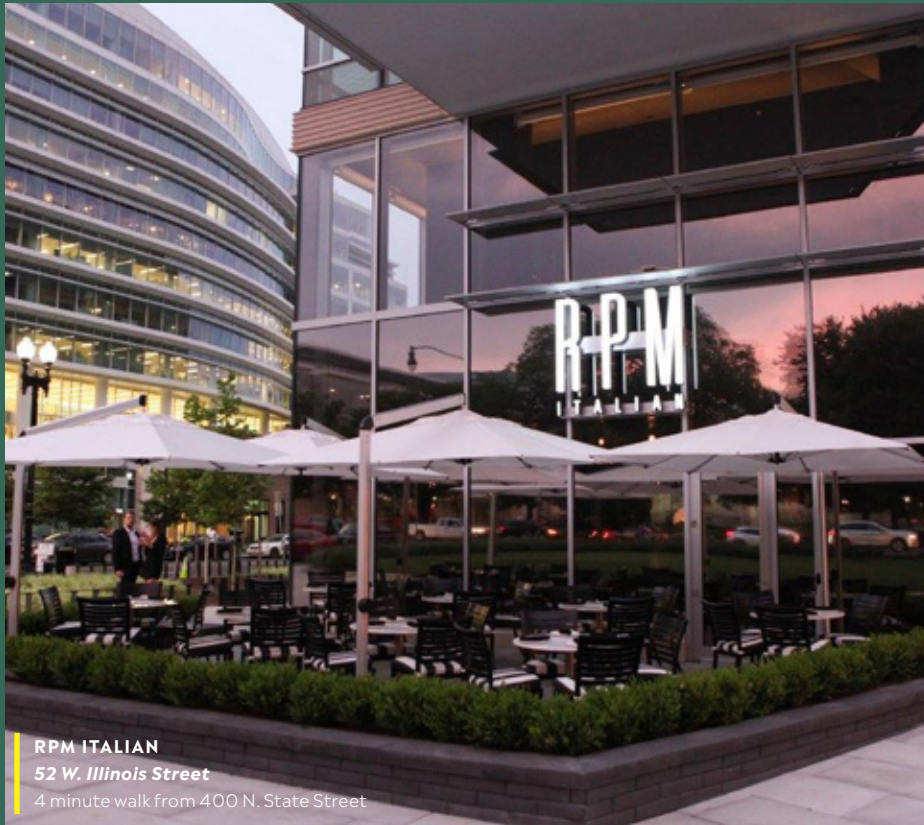
RPM ITALIAN 52 W. Illinois Street 4 minute walk from 400 N. State Street