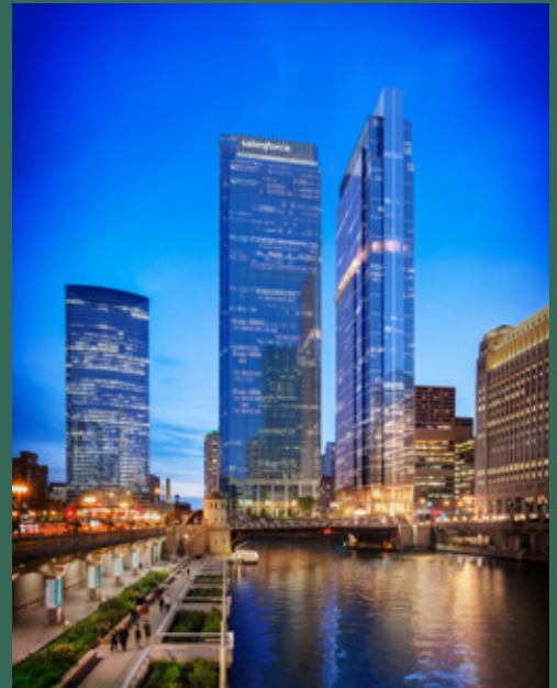
SALESFORCE TOWER CHICAGO ▲ CRM software giant Salesforce signed a 500,000 SF lease in 2018 at this 1.2M SF, 58-story office tower. Salesforce Tower is slated to open in 2023 and will be topped by a company logo and a communal "Ohana" floor.