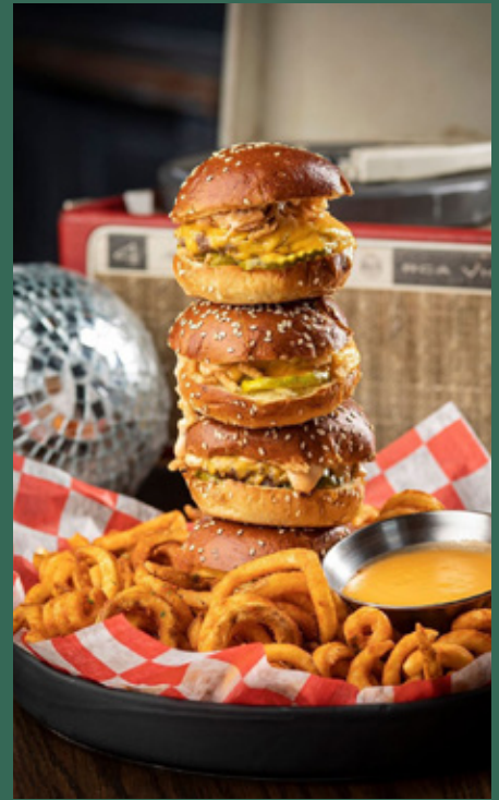
RADIO ROOM ▲ Located in the building @ the corner of Kinzie & State