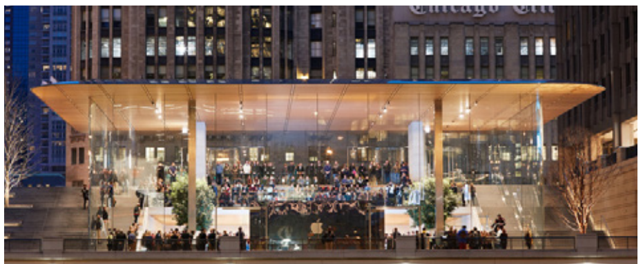
APPLE FLAGSHIP MICHIGAN AVENUE STORE - 0.2 MILE FROM 200 E. ILLINOIS