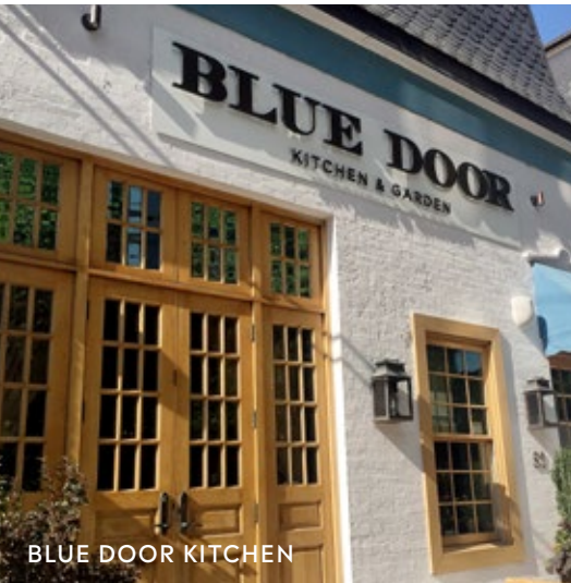
BLUE DOOR KITCHEN