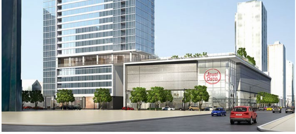
THE SINCLAIR 390-unit luxury residence with 58,000 SF retail