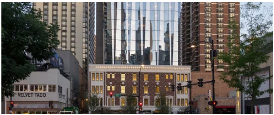
THE VICEROY HOTEL 180 room boutique hotel