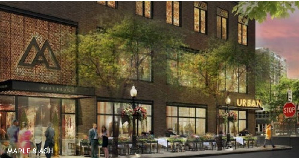
MAPLE & ASH