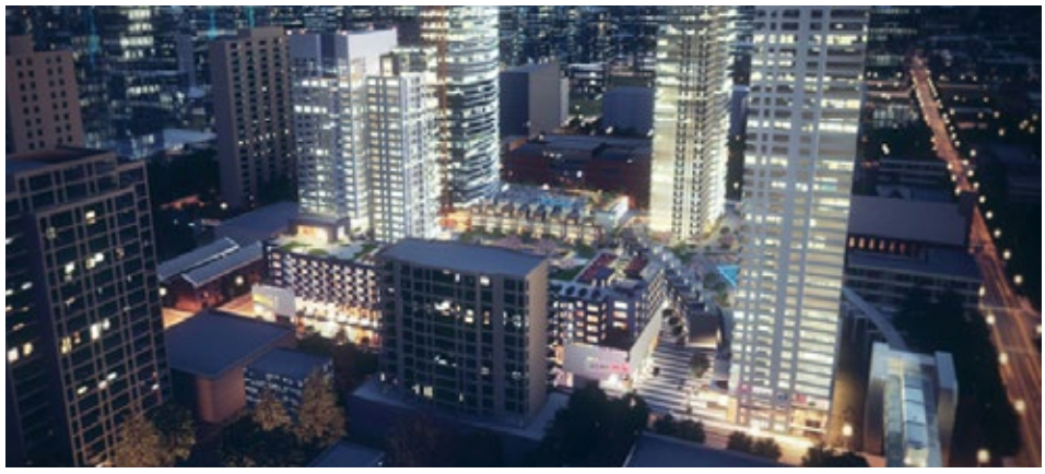
ATRIUM VILLAGE URBAN RENEWAL PROJECT 1,500 residential units and 47,000 SF retail