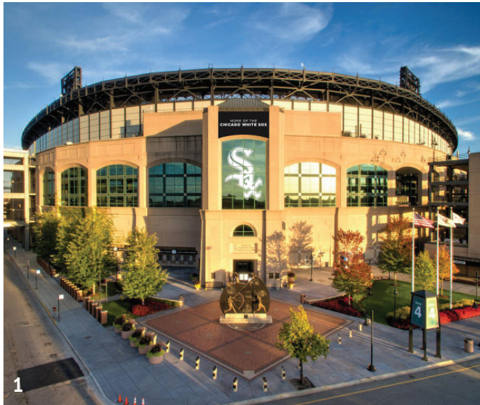
1 Guaranteed Rate Field, home of the Chicago White Sox