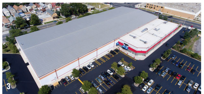
3 Chicago Indoor Sports 90,000 SF Facility