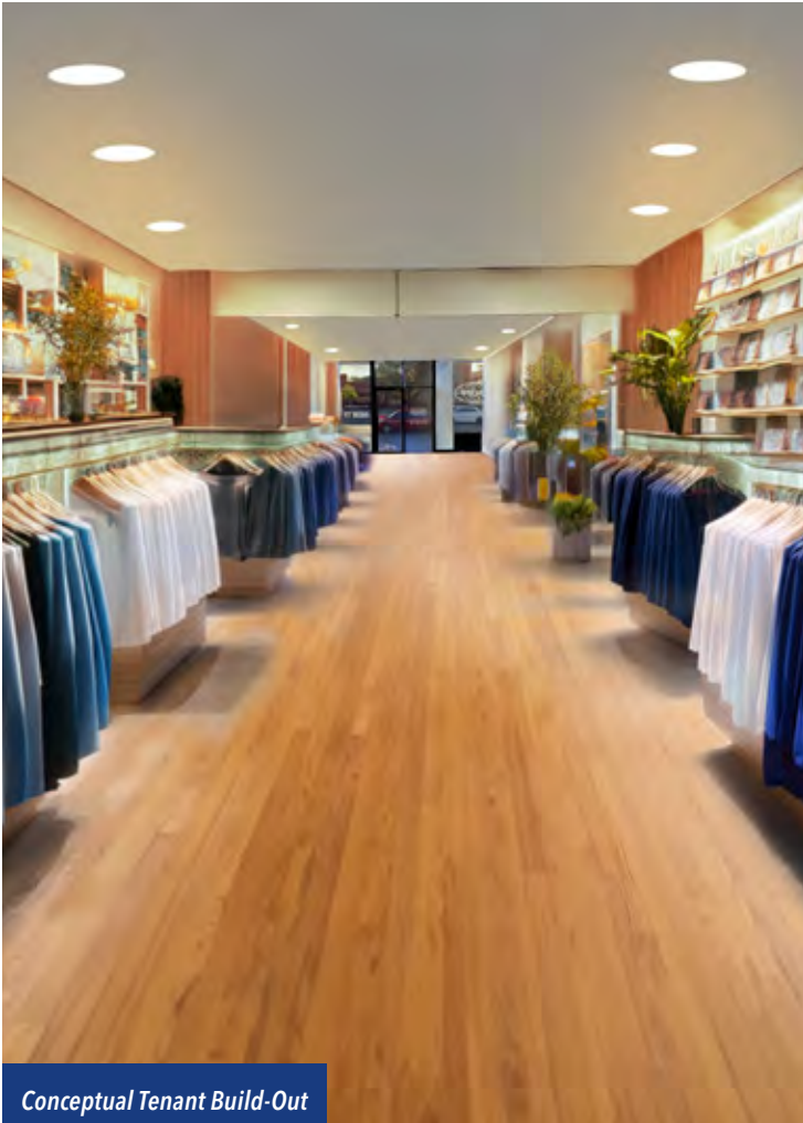
Conceptual Tenant Build-Out