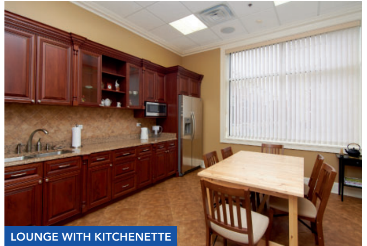
LOUNGE WITH KITCHENETTE