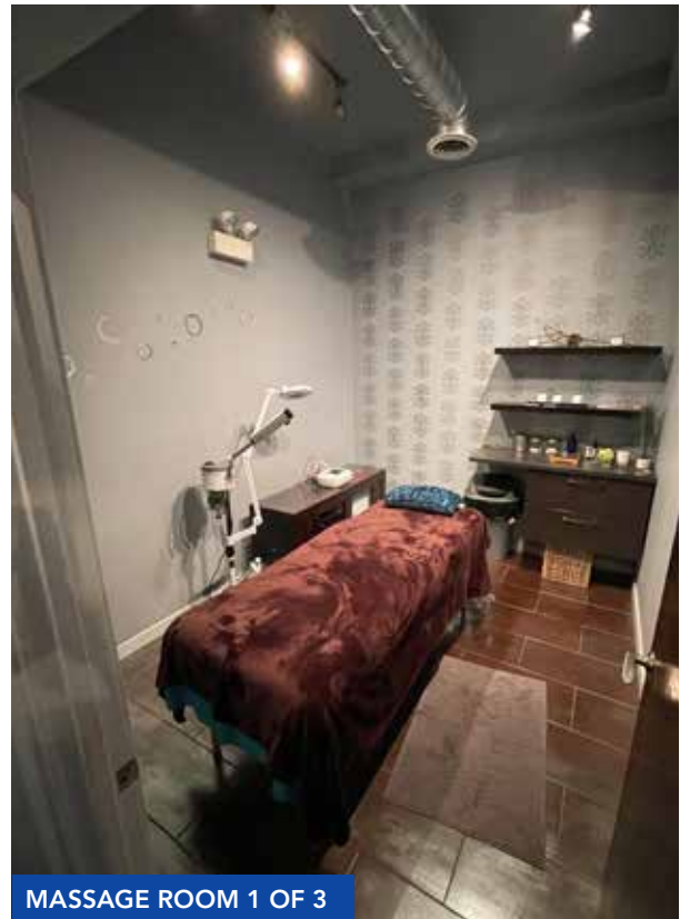
MASSAGE ROOM 1 OF 3