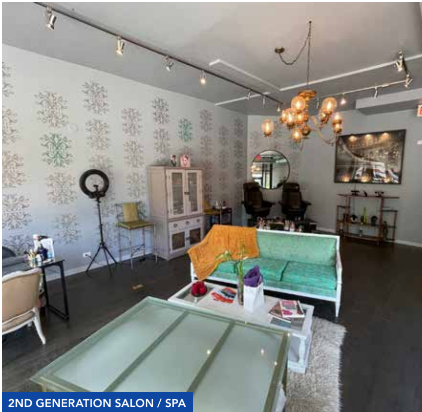
2ND GENERATION SALON / SPA