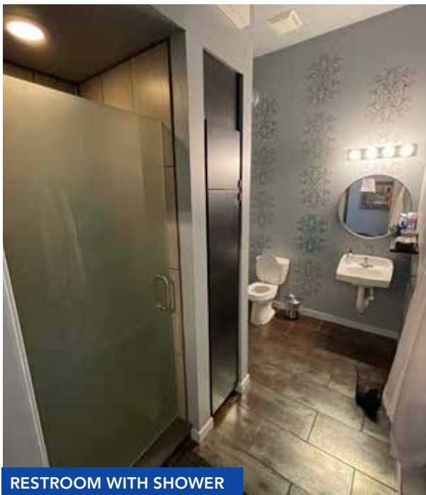
RESTROOM WITH SHOWER