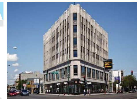
Hairpin Lofts – 40 Units Renovated

New businesses along Milwaukee Avenue include fashion boutiques and numerous trendy restaurants, bars and breweries.