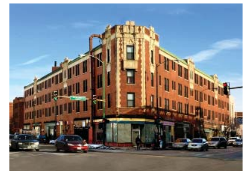
2799 N. Milwaukee – 99 Units Renovated