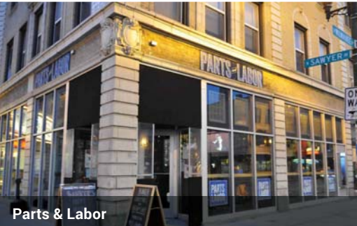
Parts & Labor