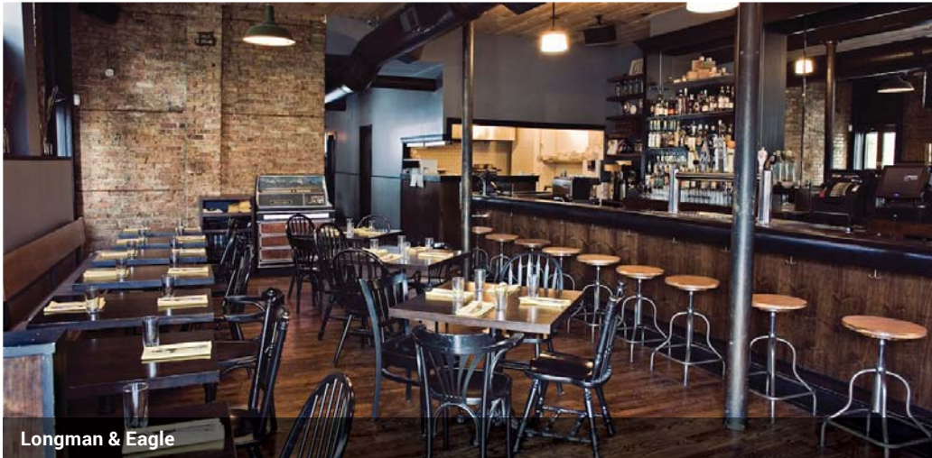
Longman & Eagle