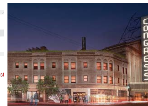
Congress Theater – $55M Renovation