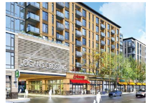
Logan's Crossing – 275 Units Proposed