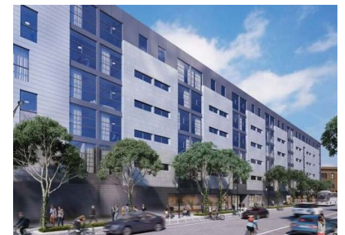
L - 120 Units