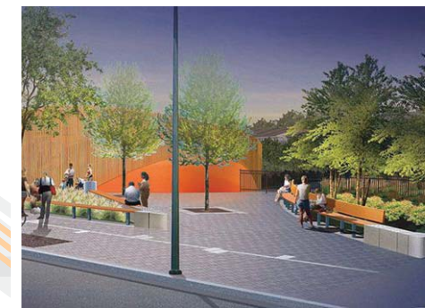
Urban Orchard Project – Proposed