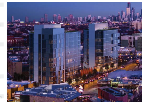
MiCa - 253 Units