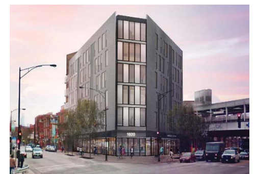
The Western – 44 Units