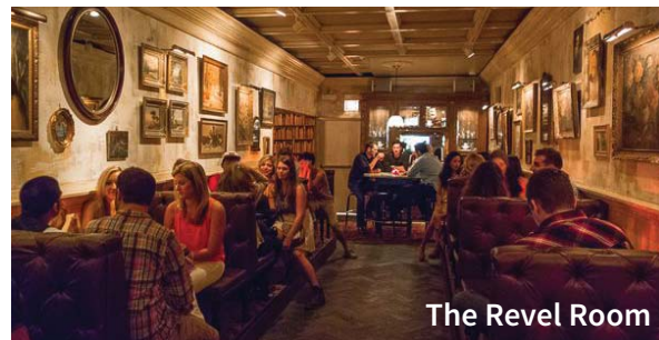
The Revel Room