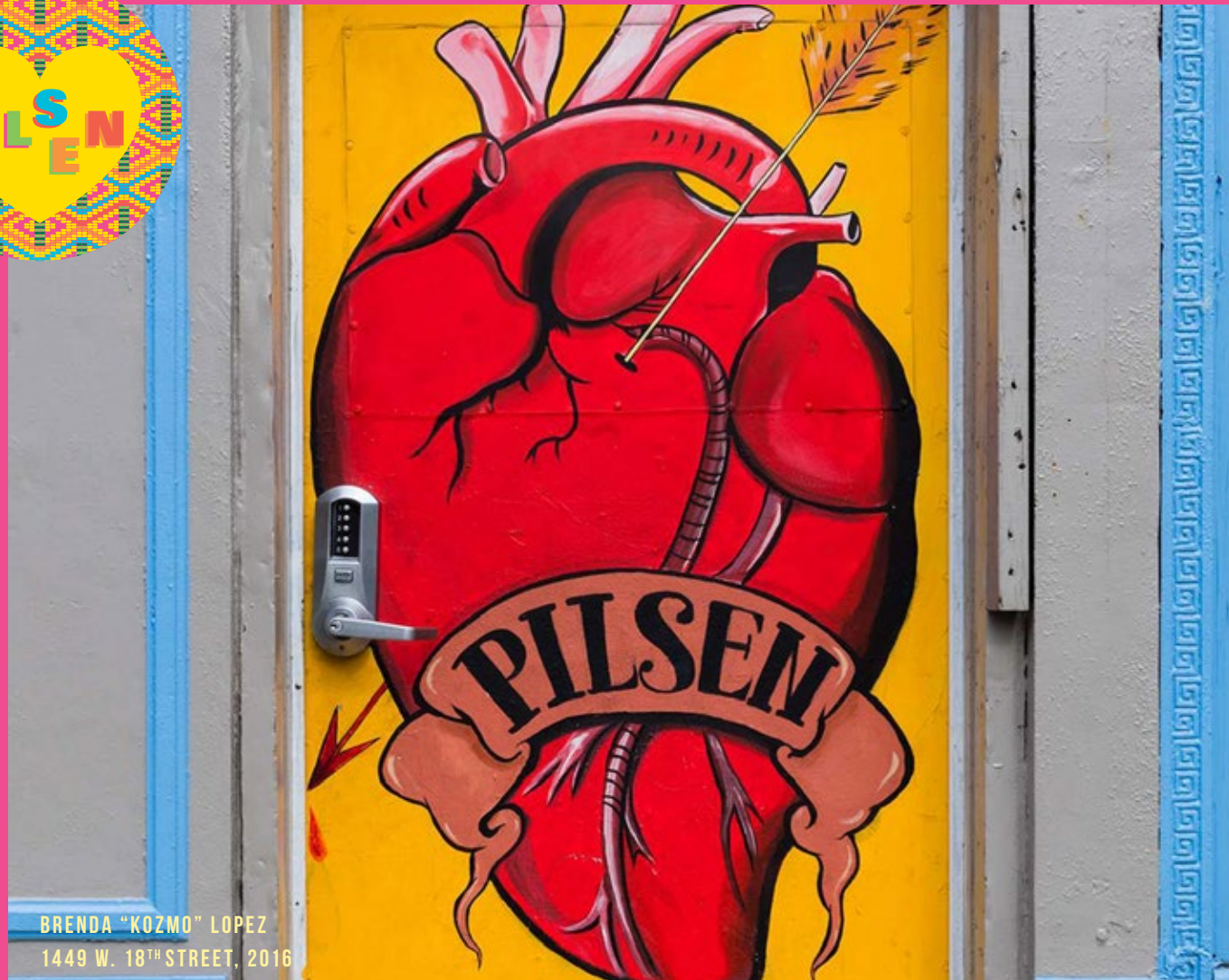
BRENDA "KOZMO" LOPEZ 1449 W. 18 TH STREET, 2016

Blended and full of diversity, Pilsen features offbeat vintage shops, galleries, and independent coffee houses alongside world-class restaurants serving everything from authentic Mexican cuisine to high-end restaurants run by award-winning chefs.