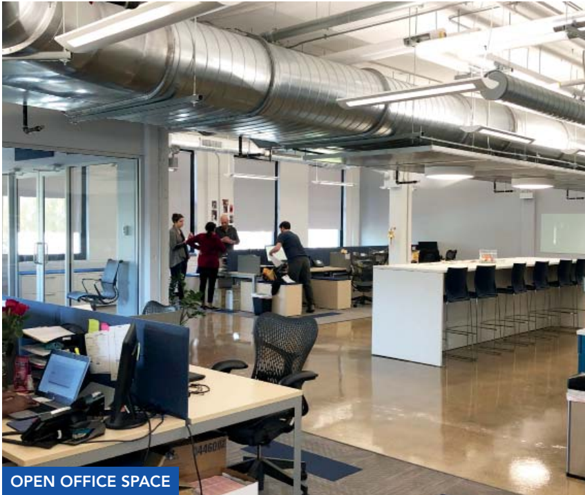
OPEN OFFICE SPACE