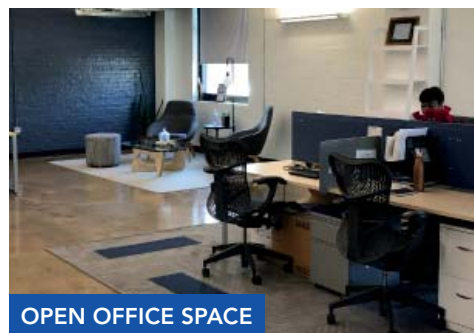
OPEN OFFICE SPACE